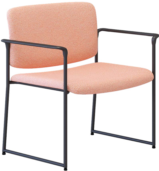
532 ARC COM COLLECTION EMERSON | AC63382 | Coral13

The Cricket Bariatric can be upholstered with any of our high-quality textiles, vinyls, or leathers. Customize your chair with our wide range of colors and grades on My Chair Maker: nightingalechairs.com/my-chair-maker