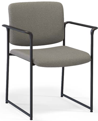
512 Sled base 300lbs capacity