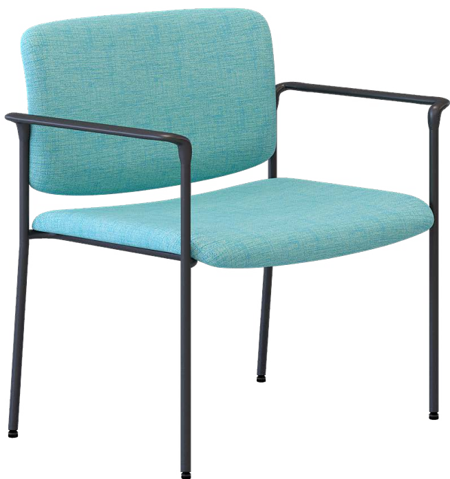
533 DESIGNER II COLLECTION MINGLE I MGL023 | Turquoise