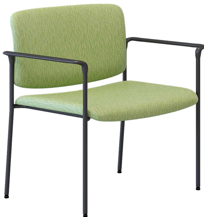
533 DESIGNER II COLLECTION RUMBA I RUMB003 | Lime