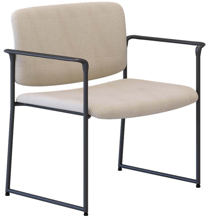
532 DESIGNER COLLECTION EPIC | EPIC07 | Limestone