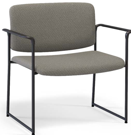
532 Sled base 500lbs capacity