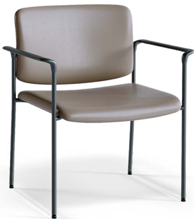
523 Armchair 400lbs capacity