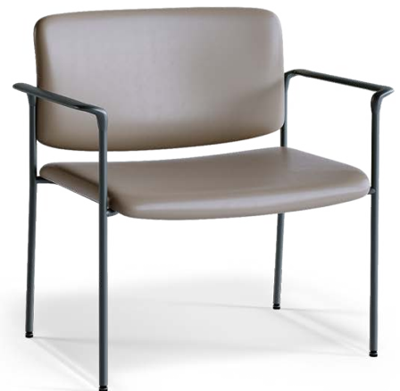
533 Armchair 500lbs capacity