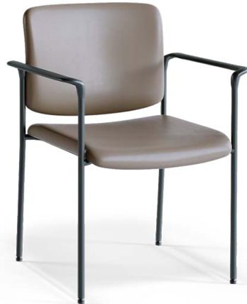
513 Armchair 300lbs capacity