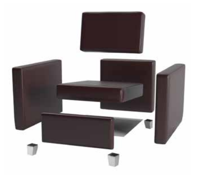
The various parts of the 1221-CH chair

The Danforth II Series is the perfect combination of comfort, style and functionality. It is a lounge solution that will allow your work life to feel as comfortable as possible.