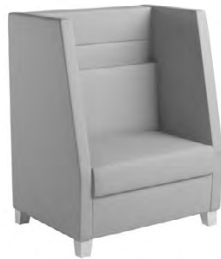
Trullo 3000 Series