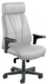
Presider 7700 Series