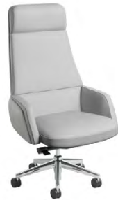
EC6 635 Series