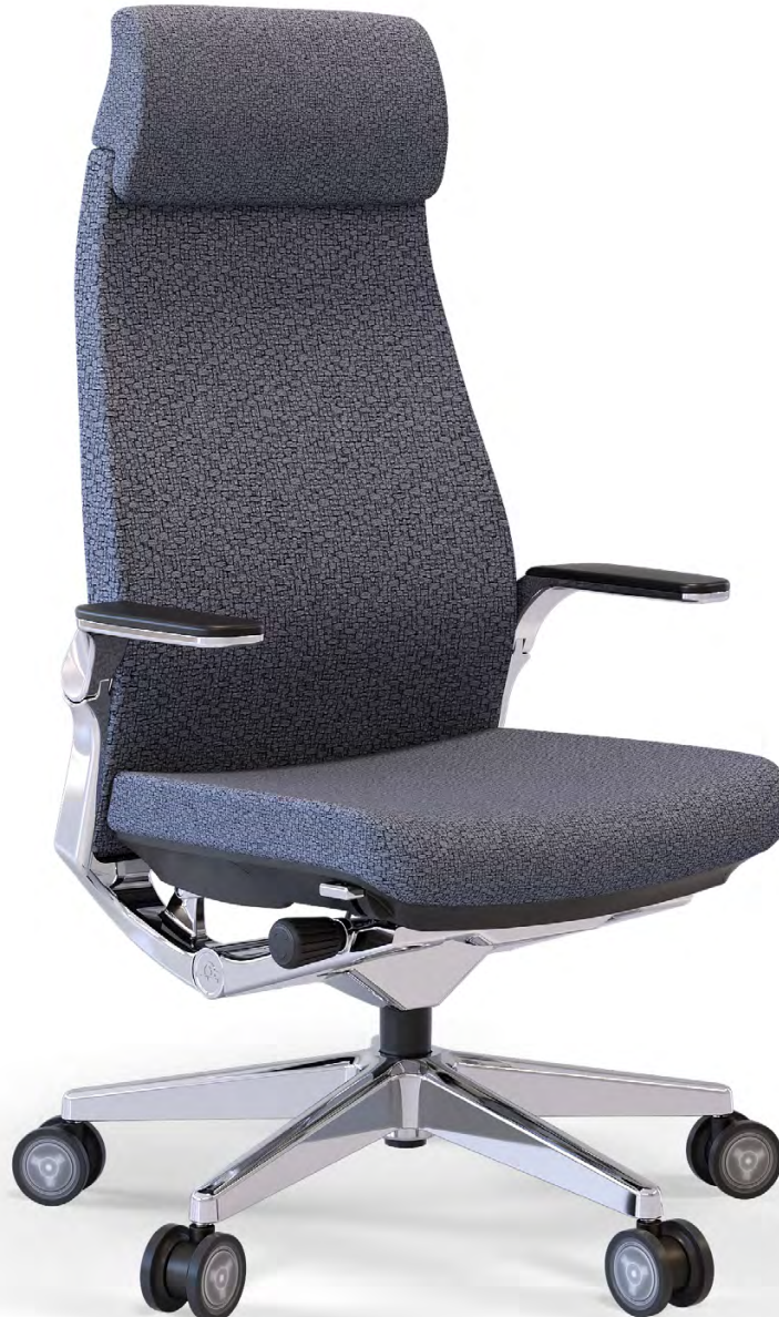
NLC 2020D-FL Foundation | Wolf

Once someone sits in their chair it becomes part of their corporate identity, they claim ownership over it and become attached. This bond is why some people refuse to get a new chair despite their current one being out of date or beyond repair. With that in mind, customers should look to invest in quality seating products that deliver valuable physical and emotional benefits.