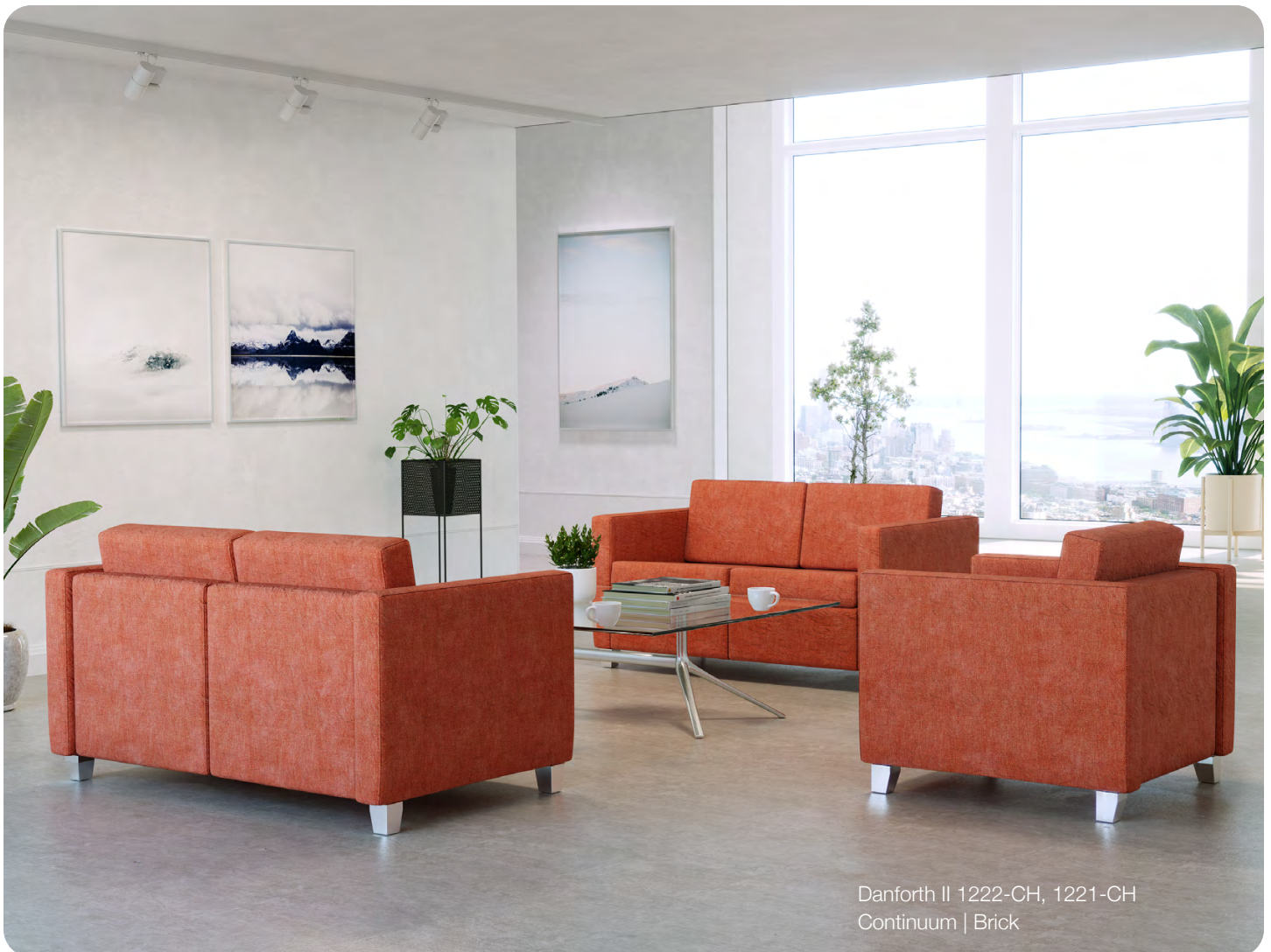
Danforth II 1222-CH, 1221-CH Continuum | Brick

With easily replaceable components the Danforth II is built to last. Its modular form makes this lounge seat versatile and economical as it can be tailored to fit small or large spaces.