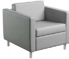
Danforth II 1220 Series