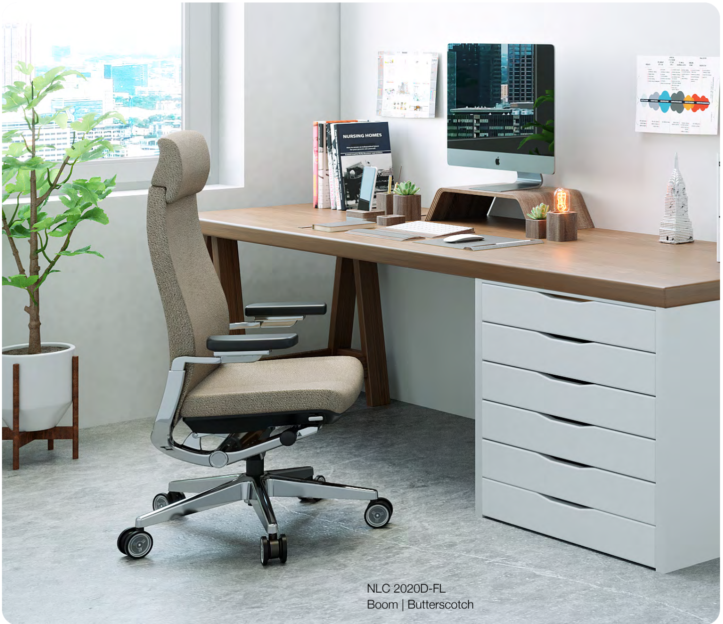
NLC-2020D-FL Boom | Butterscotch

Nightingale creates quality, hand-crafted seating products that provide customers with significant financial, physical and emotional value. A Nightingale chair is a financial investment that is built to last. Our state-of-the-art testing facility and innovation lab result in the development of high ergonomic and comfort standards. Combined with several adjustable features and customizable options, Nightingale chairs deliver exceptional physical value. Emotional value grows overtime but starts with knowing that each chair is made in our waste-free facility with recycled materials. The hassle-free parts warranty and excellent after-sale service allows customers to enjoy their chair for as long as possible.