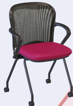
Prism Solid Collection