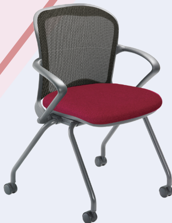
Garnet17 Arc Com Collection