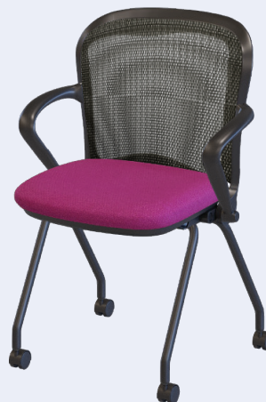
Raspberry Designer III Collection