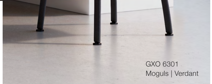
GXO 6301 Moguls | Verdant

The GXO's ergonomically designed fixed short arms with polyurethane pads provide support while allowing easy access in and out of the chair. The seat comes standard with ENERSORB™ foam which ergonomically disperses your weight, conforms to your body to relive pressure points and reverts to its original form afterward, making it universally comfortable for all users. The seat also boasts a waterfall design which gently slopes to reduce muscle fatigue and promote good posture. The GXO far surpasses the comfort levels and ergonomic standards that are usually seen in guest seating options.