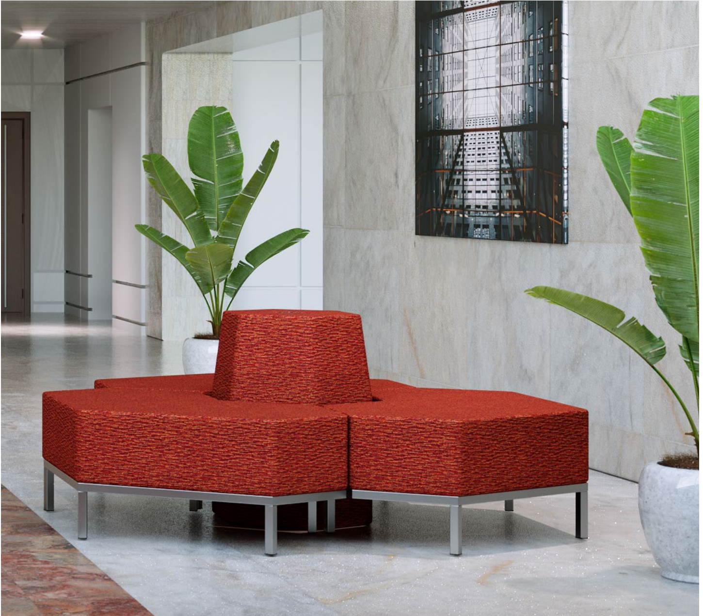
JOEY 1310 & 1312