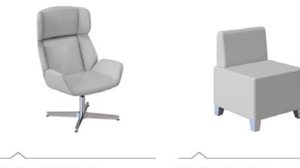
Stratford 2001 Series