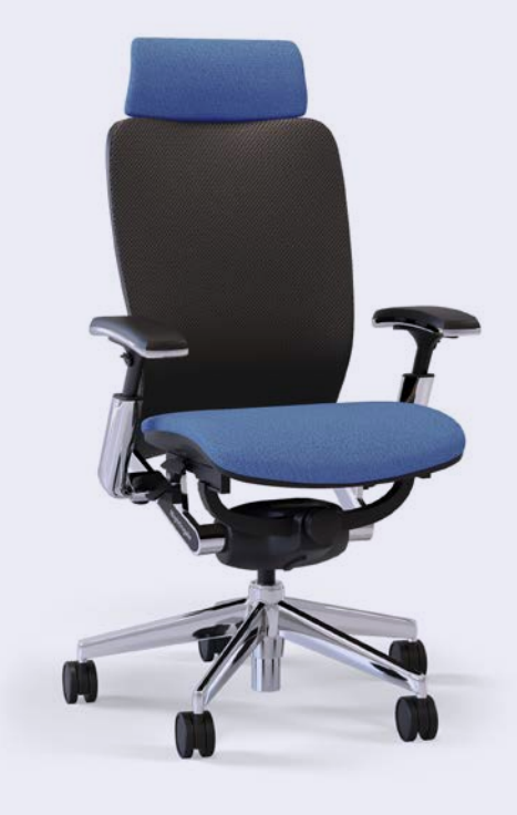
IC2 7300D Shown in Black Mesh