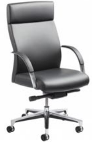
EC6 Series 635