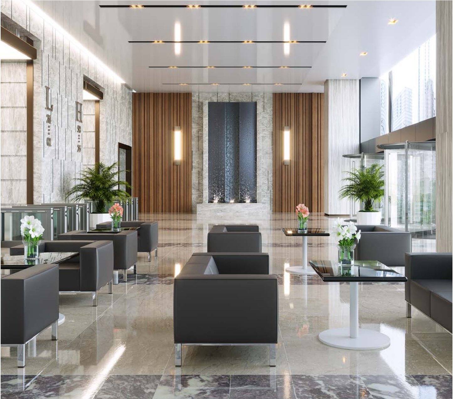
LAKESHORE 1301 & 1302