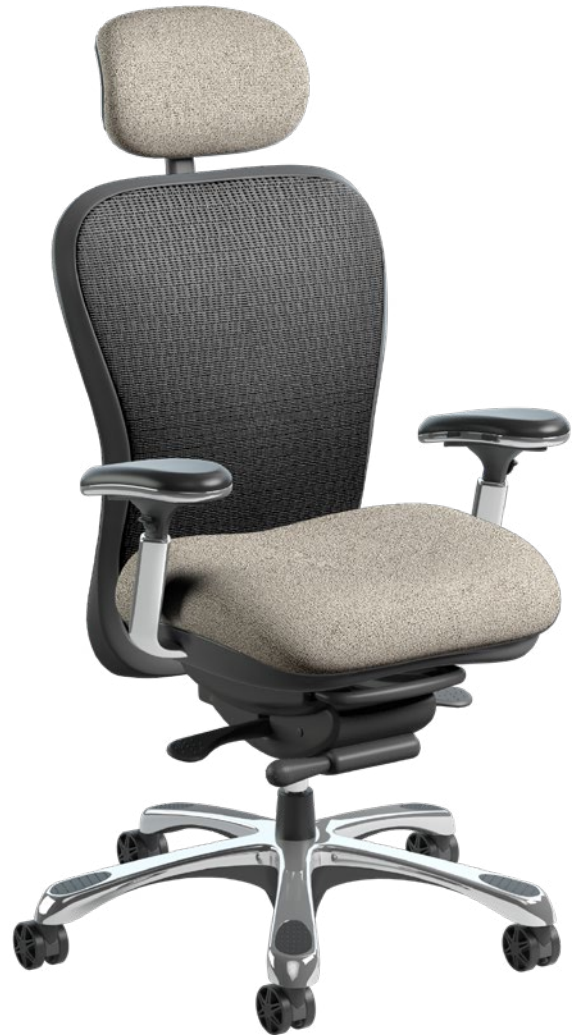
6200D-CH STRETCH COLLECTION MERIDIAN | MER007 | Cappuccino