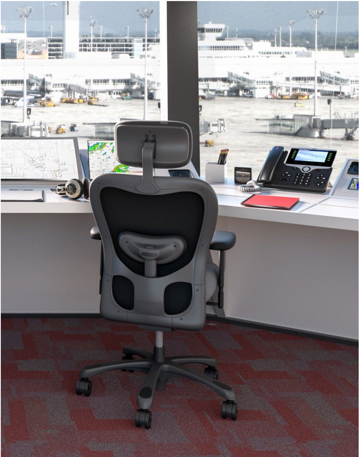
CXO 6200ti Stretch Collection (Sand)