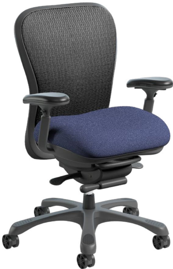
6200 STRETCH COLLECTION MERIDIAN | MER002 | Monarch Blue

The CXO™ can be upholstered with our high-quality textiles, vinyls, or leathers. Customize your chair with our wide range of colors and grades on My Chair Maker: nightingalechairs.com/my-chair-maker