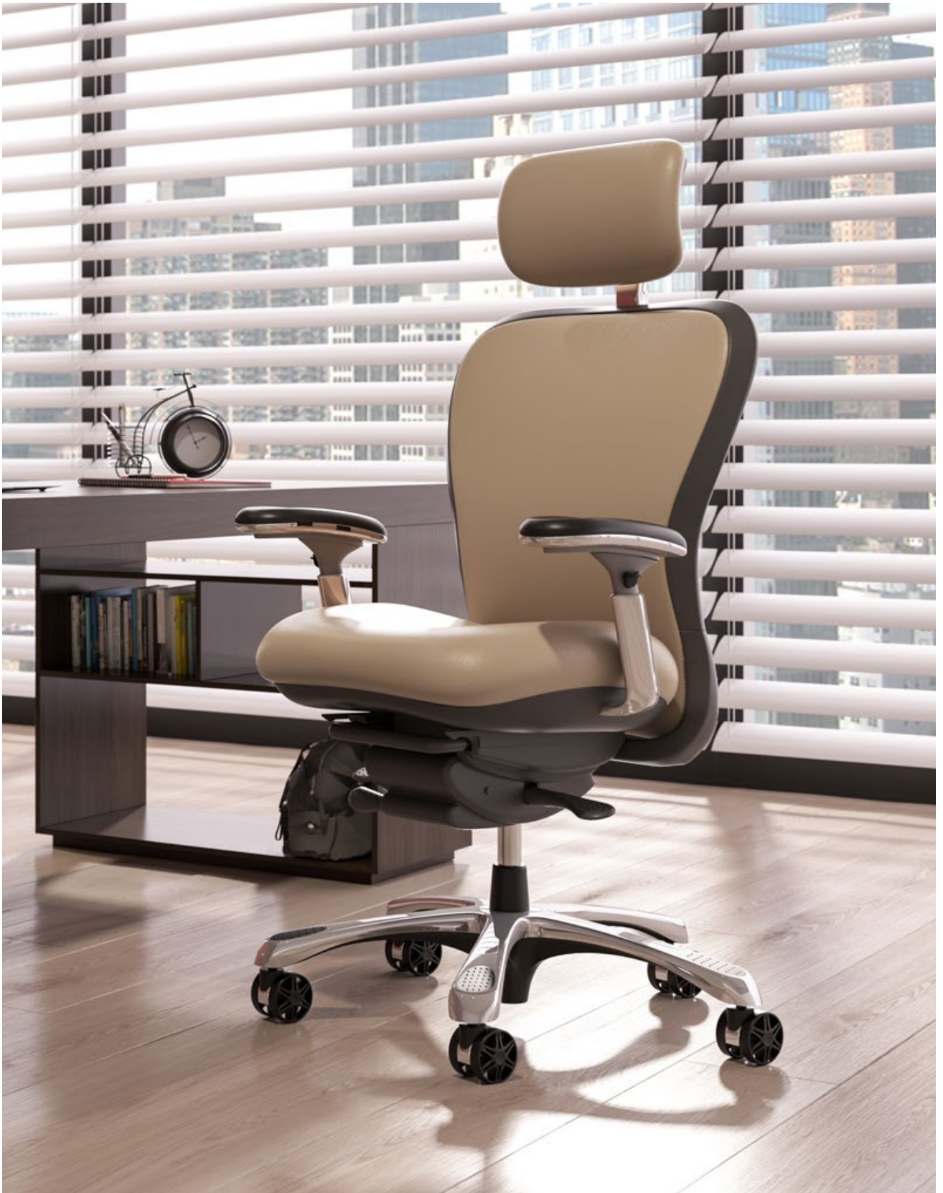
CXO L6200 Princess Leather (Sand)