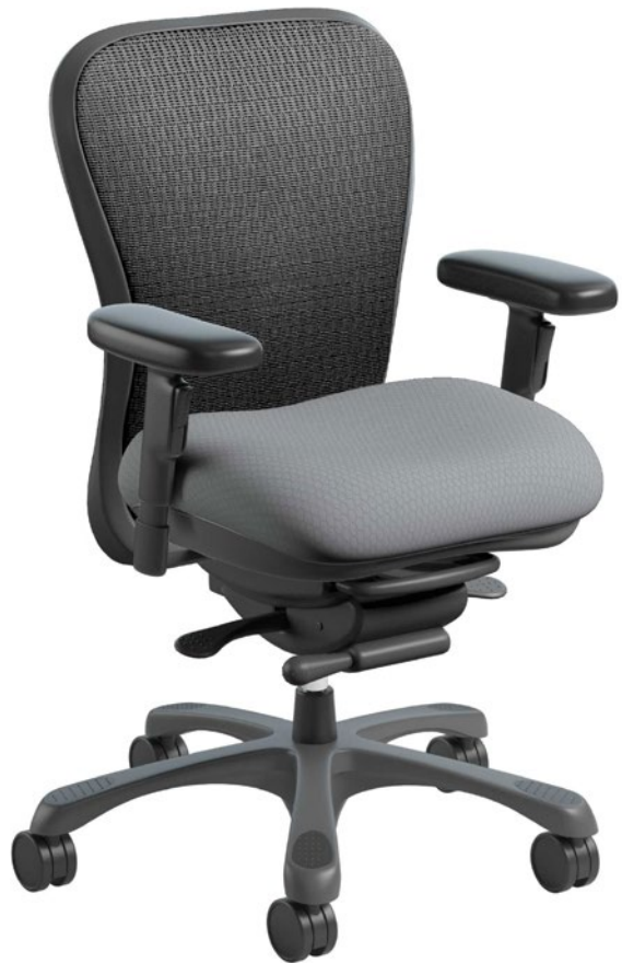
6200-TI STRETCH COLLECTION BEEHAVE | BEE10 | Slate