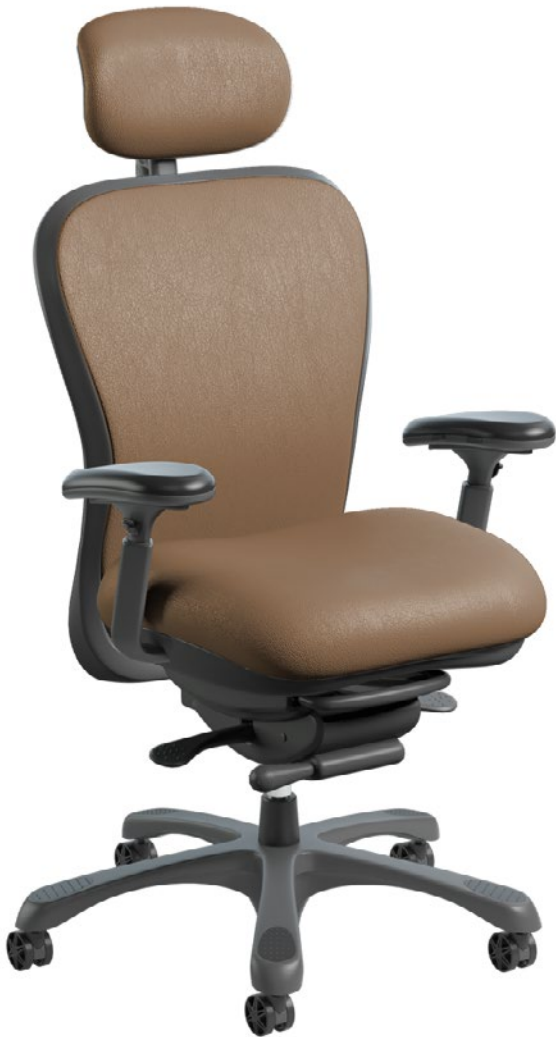
L6200D LEATHER COLLECTION PRINCESS | 185 | Almond