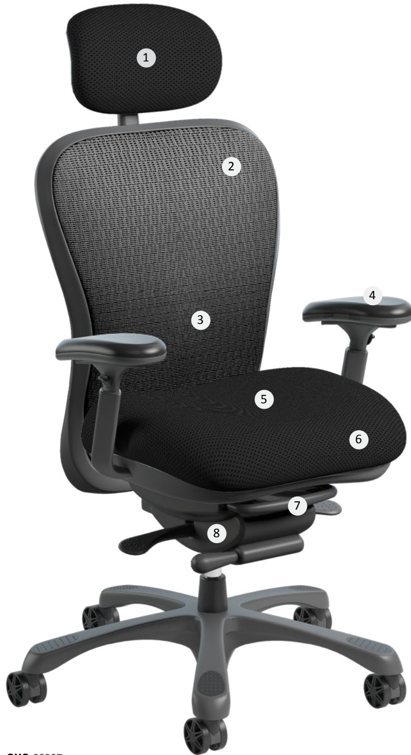
CXO 6200D Stretch Collection (Black)