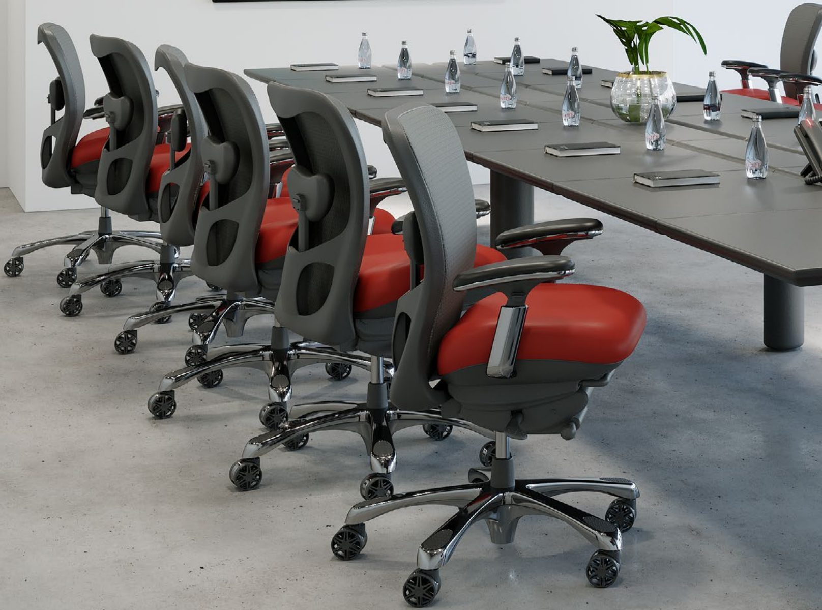
CXO 6200 Stretch Collection (Red)