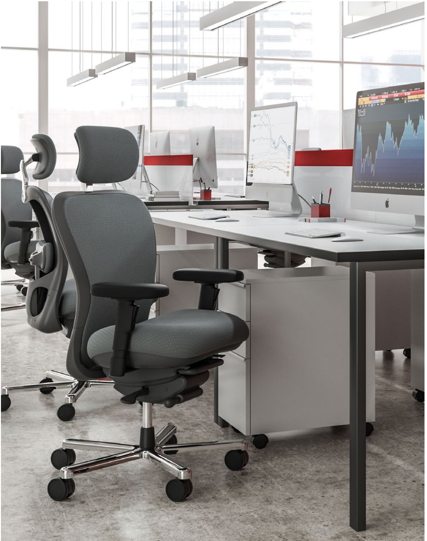
CXO 6200hd Stretch Collection (Slate)