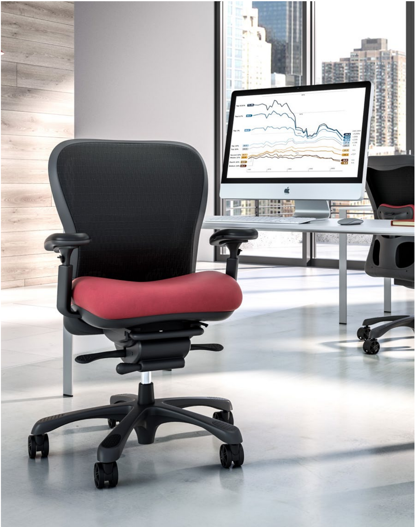
CXO 6200 Stretch Collection (Flare)