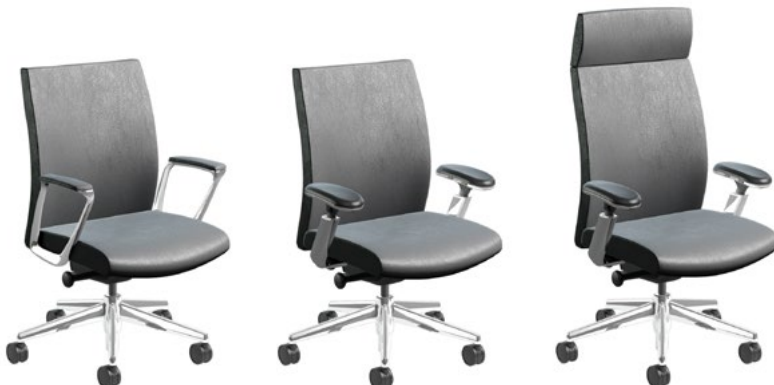
335 Mid Back Executive