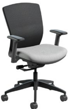
7280 Mid Back Task