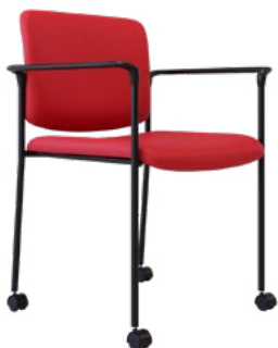
500FCA Stacker with Casters