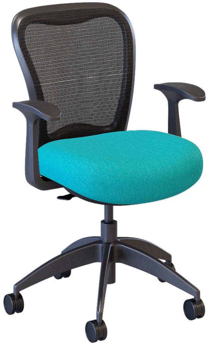
5900 DESIGNER III COLLECTION CONTINUUM | CONT034 | Turquoise