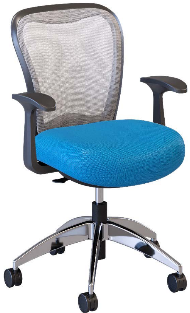
MXO 5900-SM-CH Mid Back Task with White Mesh & Polished Aluminum Base