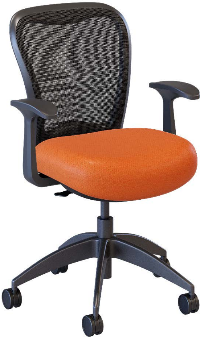
5900 DESIGNER III COLLECTION THEORY | THRY009 | Mango