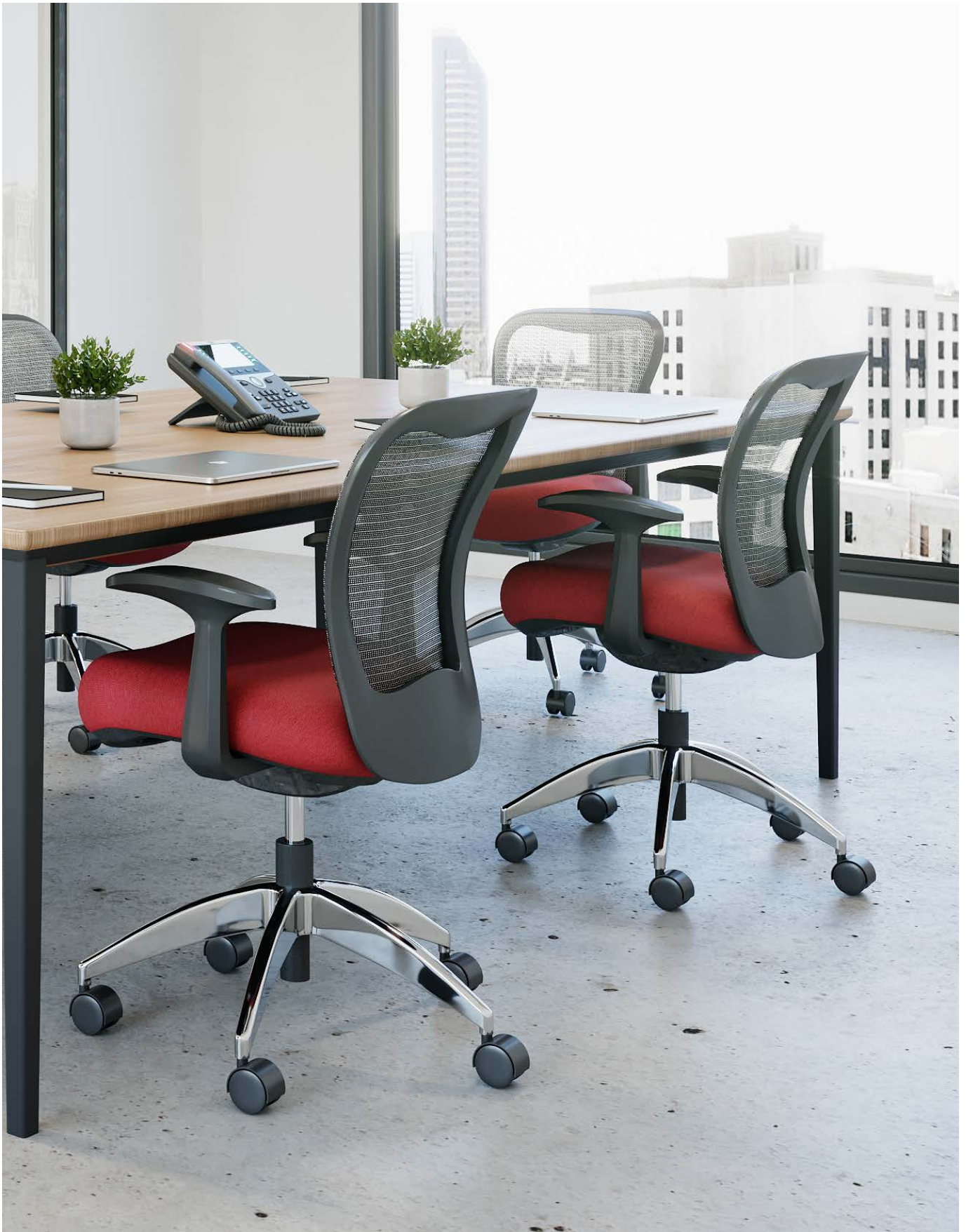
MXO 5900-CH Theory (Port)