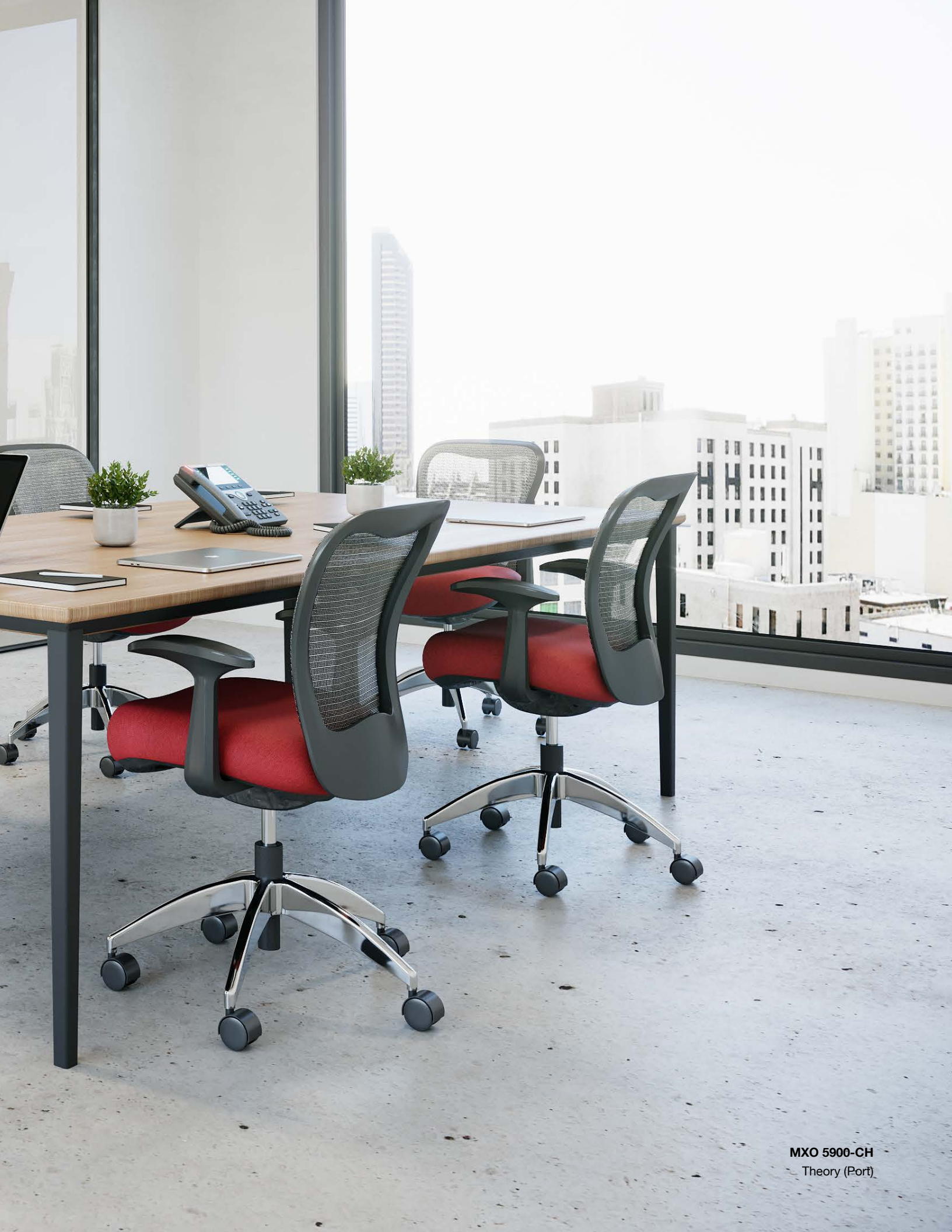
MXO 5900-CH Theory (Port)