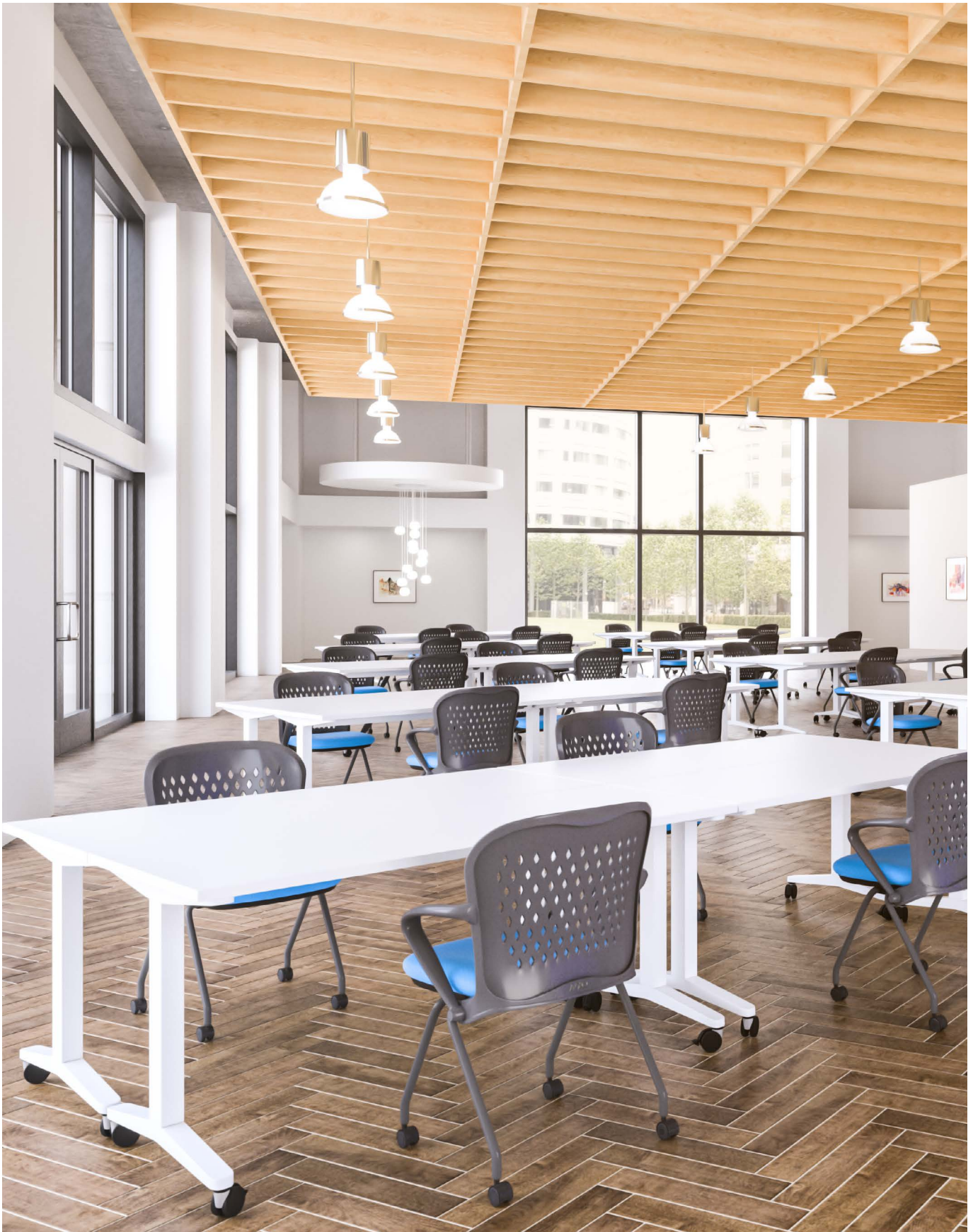
NXO 6401-TC Behave (Azure)