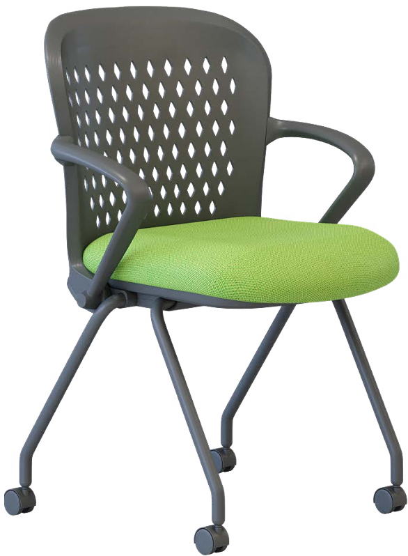
6401 DESIGNER III COLLECTION OPTIC | OPT023 | Springtime

The NXO can be upholstered with our high-quality textiles, vinyls, or leathers. Customize your chair with our wide range of colors and grades on My Chair Maker: nightingalechairs.com/my-chair-maker