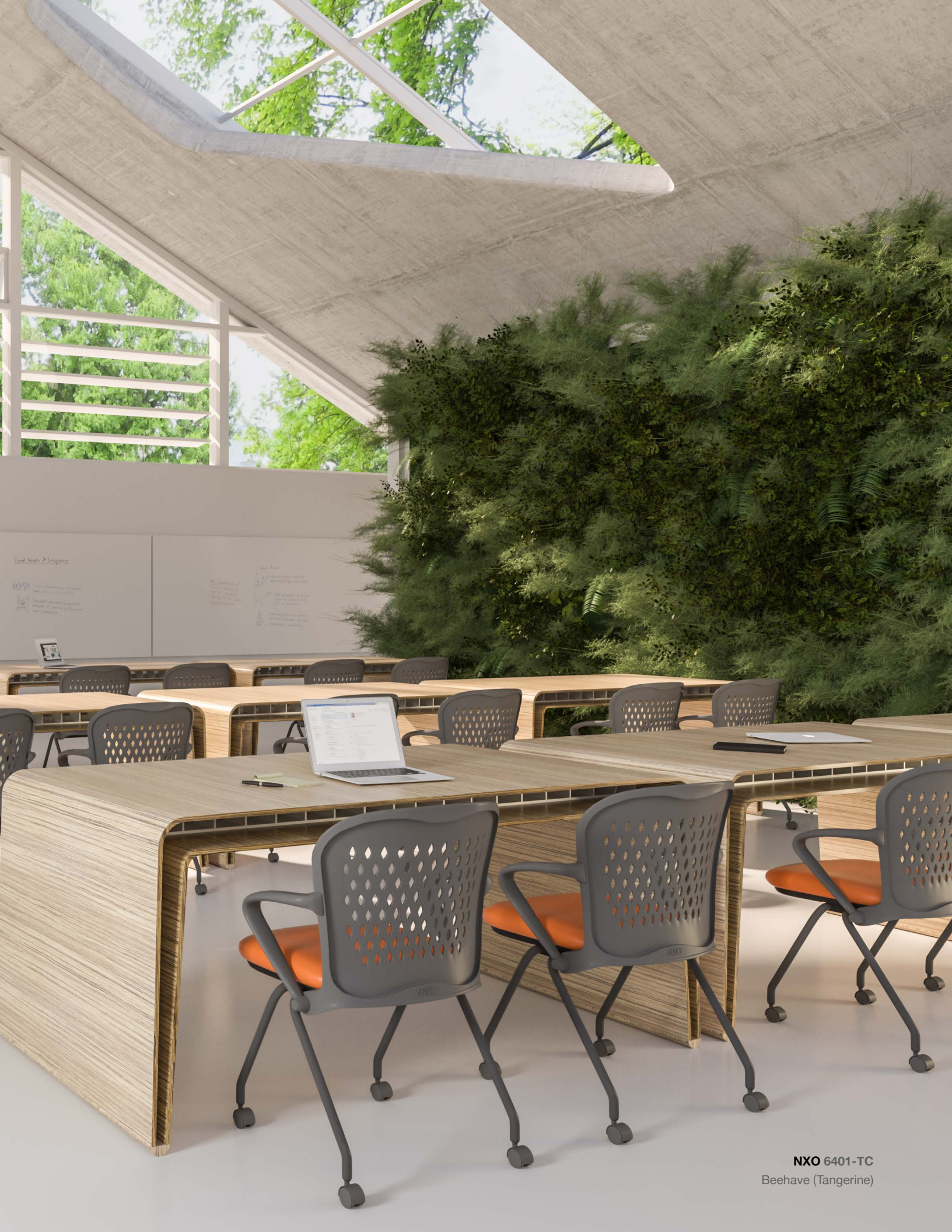
NXO 6401-TC Beehive (Tangerine)