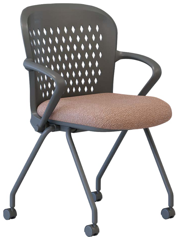
6401 DESIGNER COLLECTION FUSE | FUSE05 | Malted