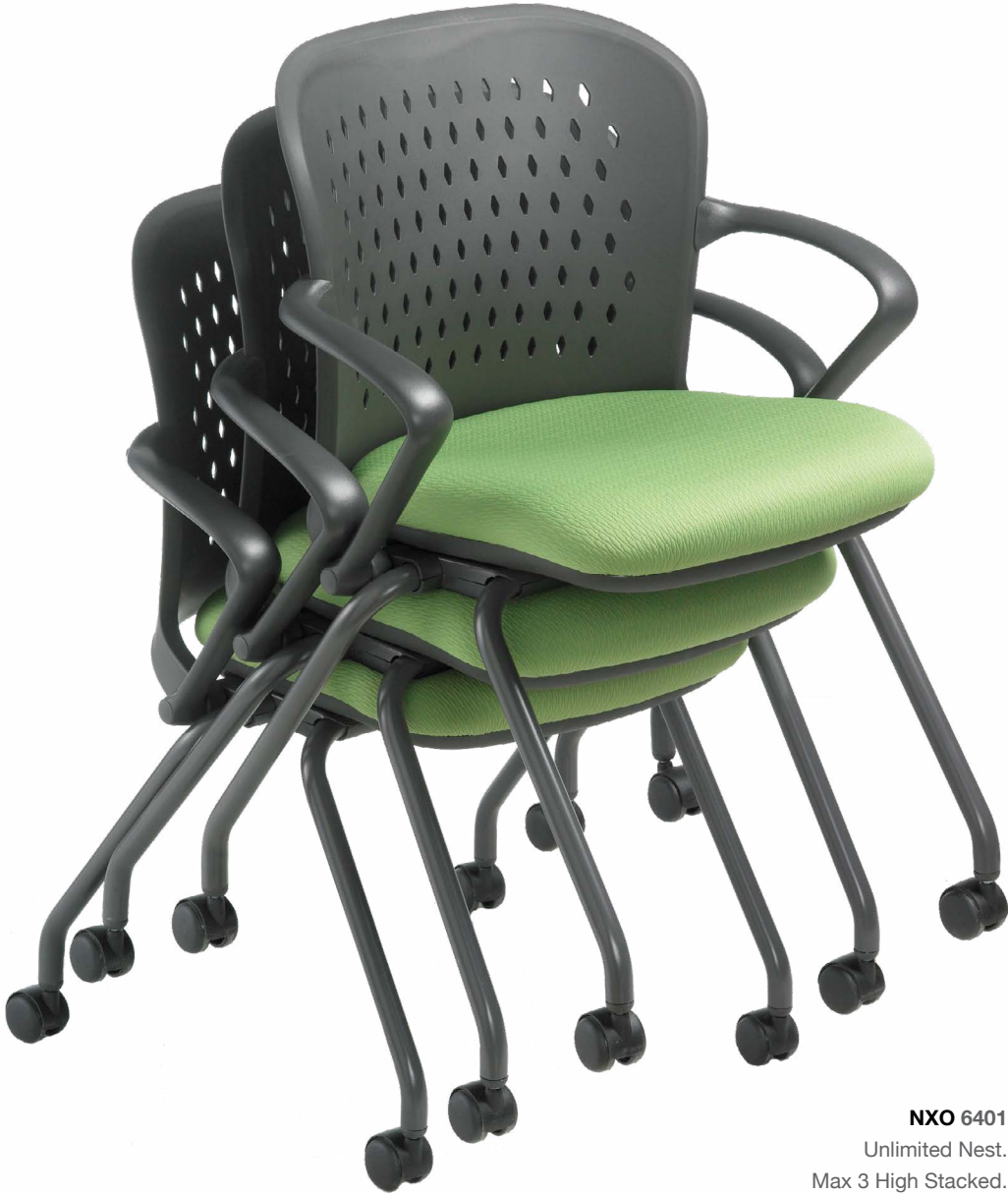
NXO 6401 Unlimited Nest. Max 3 High Stacked.

NXO™ is a refined, ergonomically comfortable chair that combines comfort with a pronounced, engaging design. Add a full range of fabric, vinyl or leather finishes and the NXO™ design can fit any office environment where mobility is important.