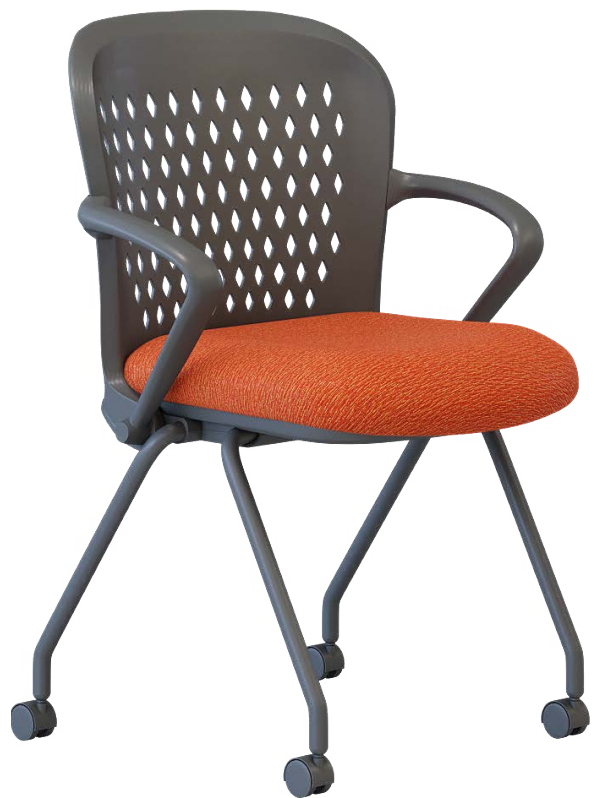
6401 DESIGNER COLLECTION FUSE | FUSE10 | Pimento