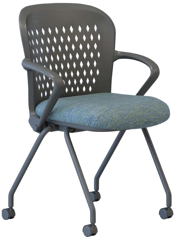
6401 DESIGNER II COLLECTION BALI | BALI014 | Ocean